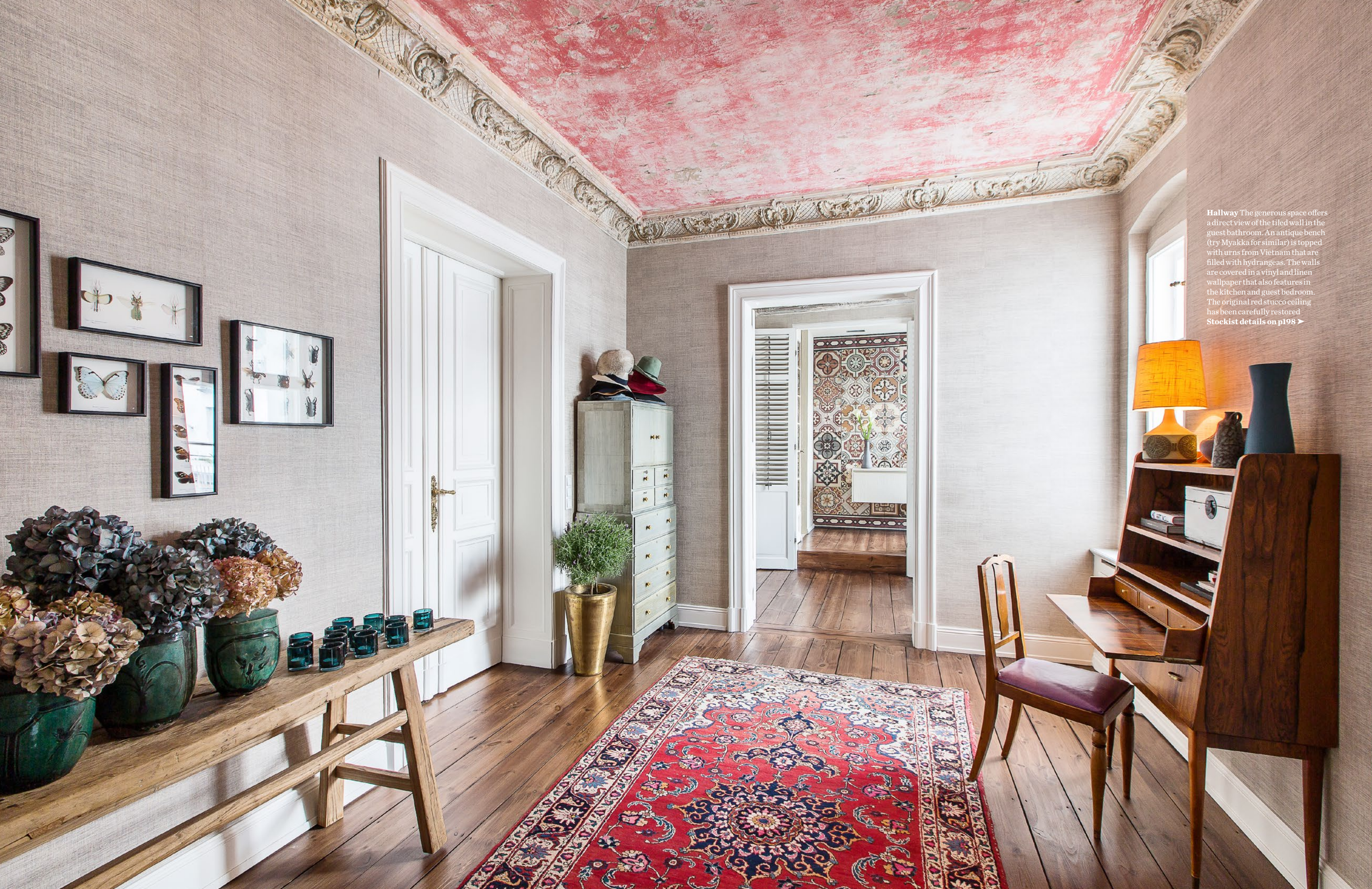
Hallway The generous space offers a direct view of the tiled wall in the guest bathroom. An antique bench (try Myakka for similar) is topped with urns from Vietnam that are filled with hydrangeas. The walls are covered in a vinyl and linen wallpaper that also features in the kitchen and guest bedroom. The original red stucco ceiling has been carefully restored Stockist details on p198 ▶