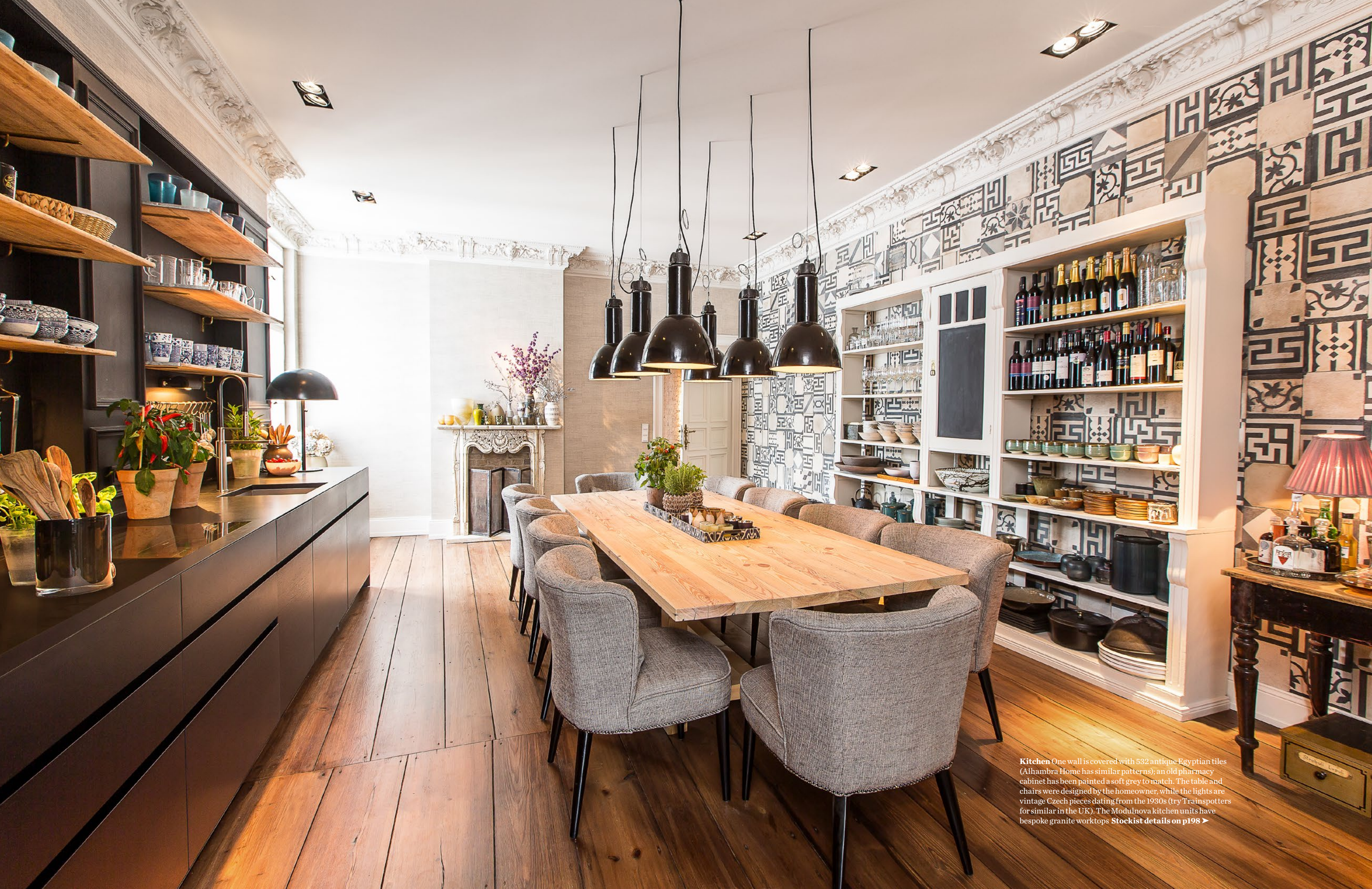
Kitchen One wall is covered with 532 antique Egyptian tiles (Alhambra Home has similar patterns); an old pharmacy cabinet has been painted a soft grey to match. The table and chairs were designed by the homeowner, while the lights are vintage Czech pieces dating from the 1930s (try Trainspotter for similar in the UK). The Modulnova kitchen units have bespoke granite worktops Stockist details on p198 >